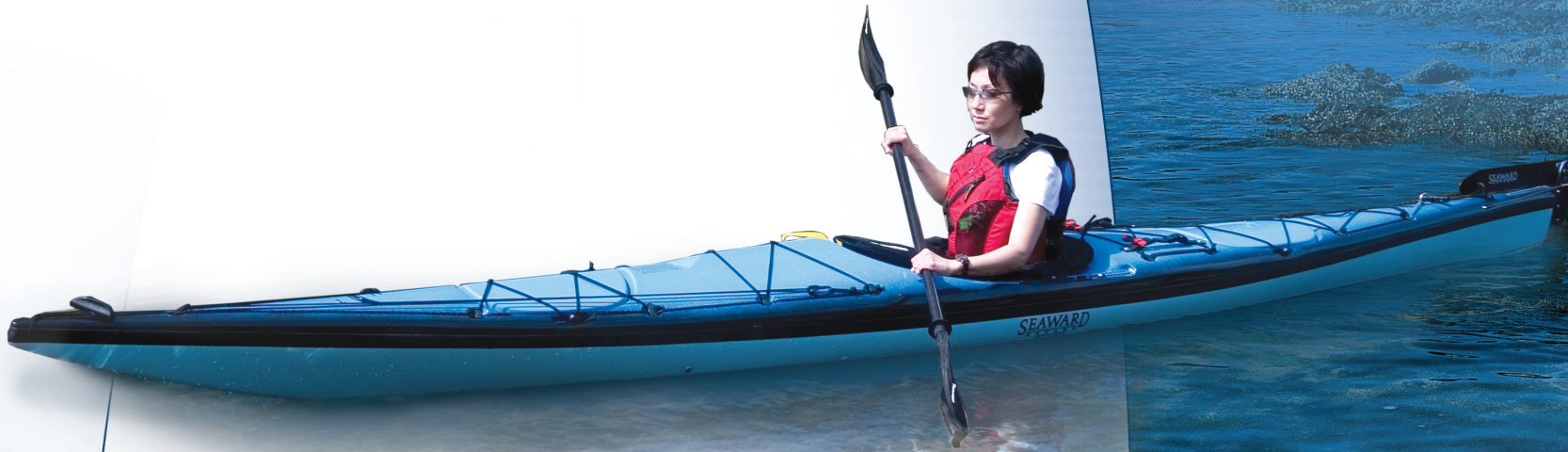
Luna shown with cyan blue deck & hatches, black fade & seam and a baby blue hull.