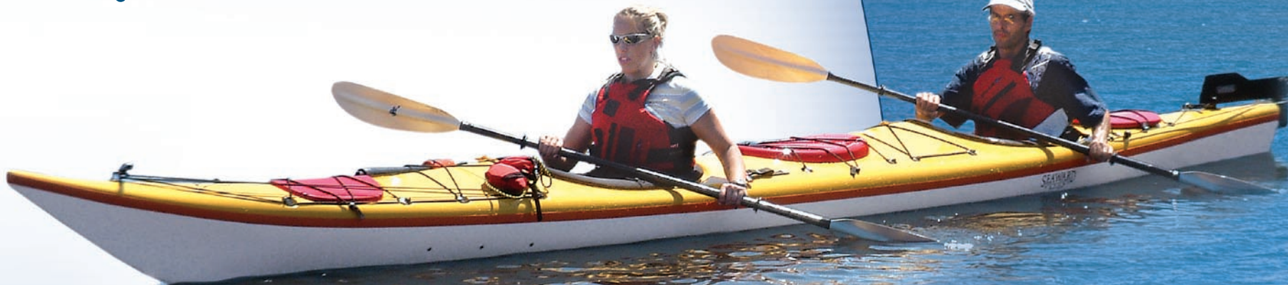
Passat G3 shown with yellow deck, red hatches, mandarin seam and a white hull.