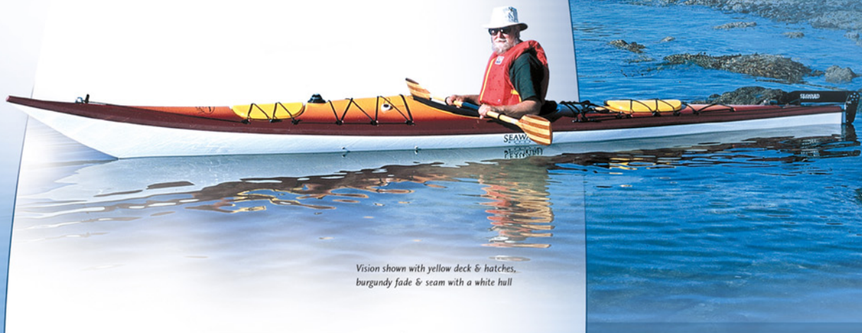
Vision shown with yellow deck & hatches, burgundy fade & seam with a white hull